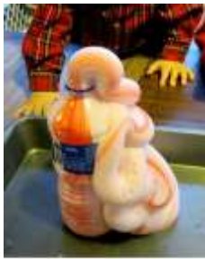
Elephant Toothpaste

Try the experiment again, but change the size of the bottle. How does this affect the amount of foam produced?